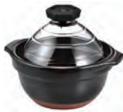
GNR-200-B C/T4 803862 W270 / D230 / H210 top opening diameter 200 for 4-6 servings