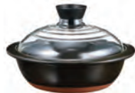
GDN-225-B C/T6 803626 φ275 / H170 top opening diameter 225 full capacity 2,000ml