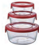
SYTN-2518-R C/T18 761759