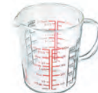
CMJW-500 C/T24 530324 W150 / D105 / H120 top opening diameter 105 practical capacity 500ml