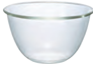
MXP-2200 C/T12 420359 φ210 / H120 top opening diameter 210 full capacity 2,200ml