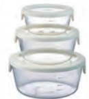
SYTN-2518-OW C/T18 761742 S: W114 / D112 / H53 φ105 M: W142 / D138 / H65 φ131 L: W170 / D168 / H78 φ160 full capacity 250ml / 600ml / 1,200ml