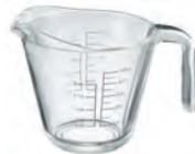
MJP-500-GR C/T12 530591 W173 / D128 / H123 top opening diameter 128 practical capacity 500ml