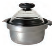
GIS-200 C/T6 803992 W260 / D216 / H200 top opening diameter 208 full capacity 2,800ml for 2-6 servings