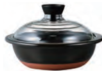
GDN-255-B C/T4 803633 φ310 / H185 top opening diameter 255 full capacity 3,000ml