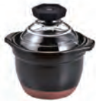
GNR-150-B C/T6 803855 W210 / D174 / H190 top opening diameter 150 for 2-4 servings