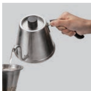
You can control the pouring by rotating the arm itself.