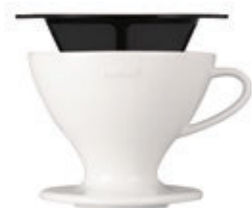
W60 Dripper PDC-02-W

A next-generation dripper that continues the tradition of the V60's spiral ribbing. The resin mesh feature a flat base that won't obstruct the flow of ground coffee in order to fully extract all the flavor of light-roasted coffee beans. Coffee can be brewed with a paper filter just like with the V60, or through only the resin mesh, which is perfect for savoring all the oils in your coffee. Use both the resin mesh and a paper filter for a crisp flavor unlike any other.