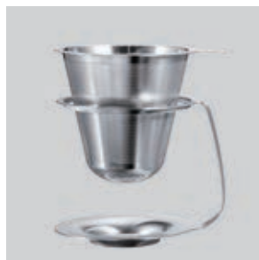
The dripper and stand are removable.