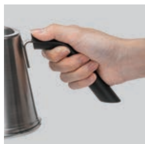
A handle designed for comfort.