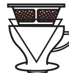
Resin mesh and paper filter extraction