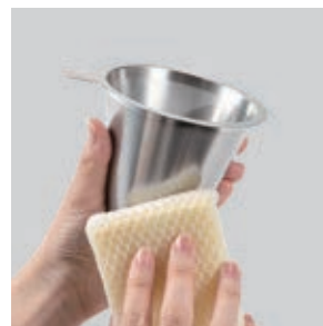
The shape is easy to wash.