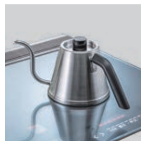
Compatible with open flame and induction heating.