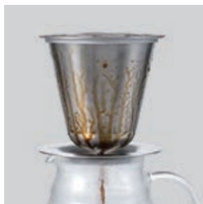
Extracts coffee oil.

Brew coffee by holding the dripper like you would with a cloth filter, or simply place it on a server.