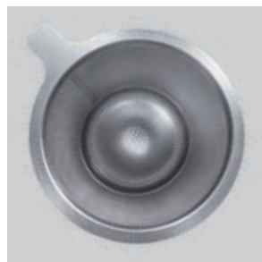
A dripper with a new structure that does not generate fine powder and drains hot water easily.