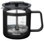
Cafe Press U CPU-2-B

C/T24 105843 W139 x D93 x H116mm \Phi 90 Practical capacity 300mL 2cups