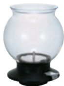
Tea Dripper LARGO TDR-80B

C/T12 022300 W130 x D130 x H165mm \Phi 100 Practical capacity 800ml