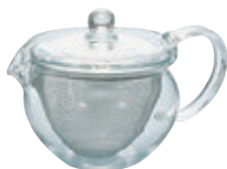
Cha Cha Kyusu Maru CHJMN-30T

C/T24 093102 W143 x D98 x H98mm \Phi 94mm Practical capacity 300mL