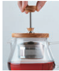
Brew to your desired strength.