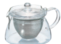
Cha Cha Kyusu Kaku CHJKN-45T

C/T24 093126 W173 x D132 x H108mm \Phi 107mm Practical capacity 700mL