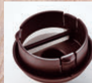
Additional meshed tea strainer included.