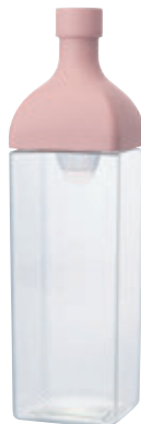
Ka-Ku Bottle KAB-120-SPR

Material: Bottle packing, Cap packing / Silicone rubber Removable bottle top, Filter, Mesh / Polypropylene Bottle / PCT resin