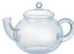
Jumping Tea Pot JP-4-SV

Material: Body/Heatproof Glass Strainer/Stainless steel