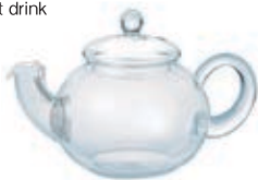
Jumping Tea Pot JP-2-SV

C/T12 410978 W195 x D120 x H 125mm \Phi 68mm Practical capacity 500mL