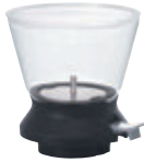
Tea Dripper LARGO 35 TDR-35B

C/T12 022331 W123 x D114 x H120mm \Phi 110 Practical capacity 350mL