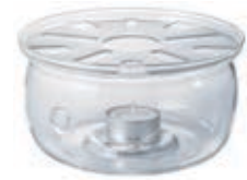
Tea Warmer M TWJ-M

Material: Metal Plate/Stainless steel Body/Heatproof glass