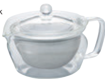
Cha Cha Kyusu "Zen" CHZ-30T

C/T24 094413 W156 x D110 x H90mm \Phi 110mm Practical capacity 300mL