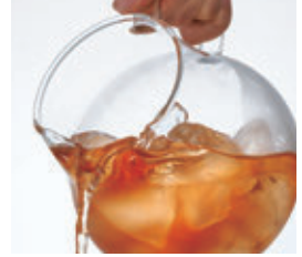
The Tea Dripper LARGO Stand Set includes an ice tea pitcher with a spout formed to prevent ice from falling out.