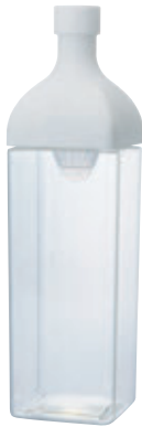
Ka-Ku Bottle KAB-120-W

C/T24 037571 W90 x D90 x H320mm \Phi 85mm Practical capacity 1,200mL