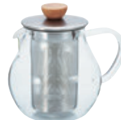
Tea Pitcher TPC-45HSV

C/T24 093928 W140 x D105 x H123mm \Phi 67mm Practical capacity 450mL