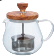
Pull-up Tea Maker TEO-45-OV

C/T24 154117 W150 x D116 x H138mm \Phi 82mm Practical capacity 450mL