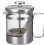
Harior 7 THSV-2-HSV

C/T24 105898 W139 x D93 x H172mm \Phi 90 Practical capacity 600mL 4cups