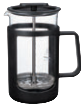
Cafe Press U CPU-4-B

Material: Body / Heatproof glass Lid, Knob, Holder / Polypropylene Shaft, Filter / Stainless steel