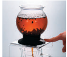
Push the switch to extract.