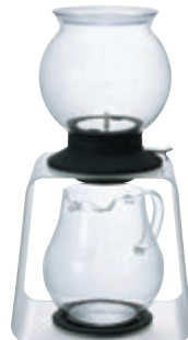
Tea Dripper LARGO Stand Set TDR-8006T

Material: Lid / AS resin Glass bowl / Heatproof glass Inner holder, Base / Silicone rubber Filter, Inner holder (Stainless steel ball) / Stainless steel Switch / Polypropylene