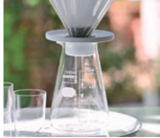
It drips from two small holes.