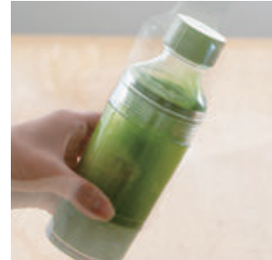
As a matcha shaker