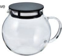
Jumping Leaf Pot JPL-60-B

C/T24 410947 W162 x D122 x H123mm \Phi 82mm Practical capacity 600mL microwave safe including lid