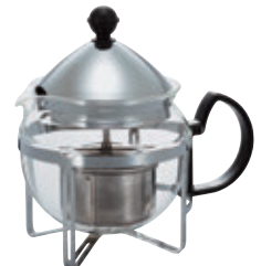
Pull-up Tea Maker Chaor 茶王 CHAN-4SV

Material: Glass bowl / Heatproof glass Lid, Shaft, Holder, Strainer / Stainless steel Knob of lid, Stopper, Handle / Polypropylene