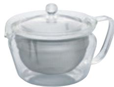
Cha Cha Kyusu "Zen" CHZ-45T

Material: Glass pot, Lid / Heatproof glass Strainer / Stainless steel