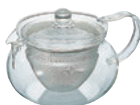
Cha Cha Kyusu Maru CHJMN-45T

Material: Glass pot, Lid / Heatproof glass Strainer / Stainless steel