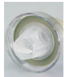
A filter mesh is set inside the lip.