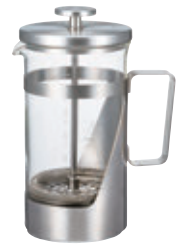
Harior 7 THSV-4-HSV

Material: Body / Heatproof glass Lid, Knob, Holder, Shaft, Filter / Stainless steel