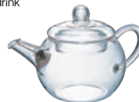
Asian Tea Pot Round Type QSM-1

C/T24 396920 W150 x D90 x H95mm \Phi 60mm Practical capacity 180mL With spiral-shaped tea strainer