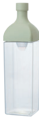
Ka-Ku Bottle KAB-120-SG