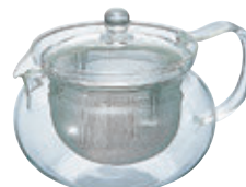
Cha Cha Kyusu Maru CHJMN-70T

C/T24 093119 W155 x D118 x H95mm \Phi 94mm Practical capacity 450mL