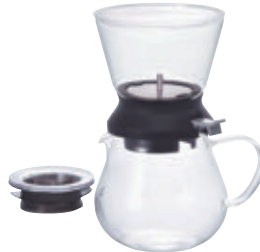
Tea Dripper LARGO 35 Server Set TDR-5012B

Material: Lid / AS resin Glass bowl / Heatproof glass Inner holder, Base / Silicone rubber Filter, Inner holder (Stainless steel ball) / Stainless steel Switch / Polypropylene