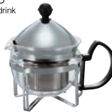
Pull-up Tea Maker Chaor 茶王 CHAN-2SV

C/T12 161207 W158 x D103 x H141mm \Phi 104mm Practical capacity 300mL 2 cups