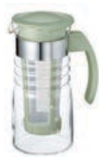
Cold brew teapot with a brewing basket tea strainer HCC-7-SG

C/T24 142985 W125 x D93 x H203mm \Phi 88mm Practical capacity 700mL