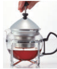
Brew to your desired strength.