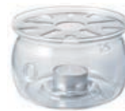
Tea Warmer S TWJ-S

Can be microwaved by removing the tea strainer