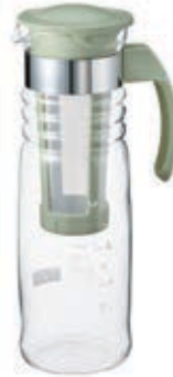
Cold brew teapot with a brewing basket tea strainer HCC-12-SG

Material: Body / Heatproof glass Lid, Strainer, frame, Handle / Polypropylene Strainer Mesh / Polyester Band / Stainless steel