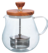
Pull-up Tea Maker TEO-70-OV

Material: Glass bowl / Heatproof glass Lid, Knob / Olive wood Knob pedestal, Inner Lid / Polypropylene Strainer, Shaft, Nut / Stainless steel