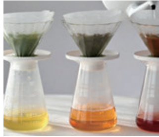
The dripper is made of Heatproof glass, so you can see the color of the tea when brewing.