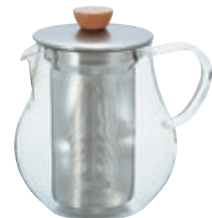
Tea Pitcher TPC-70HSV

Material: Main body/heat-resistant glass Lid strainer/stainless steel Lid knob/natural wood