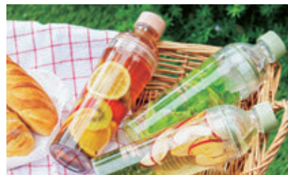
Carry around your favorite drink, cold brewed tea, or flavored water.

The lip and body are made of PCT resin, a safe material that is BPAfree, transparent, heatproof and strong against impact. As a filter is attached, your favorite cold brewed tea or fruit tea can be carried with you.