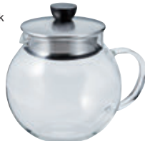
Jumping Leaf Pot JPS-60-HSV

C/T24 410954 W162 x D122 x H140mm \Phi 82mm Practical capacity 600mL